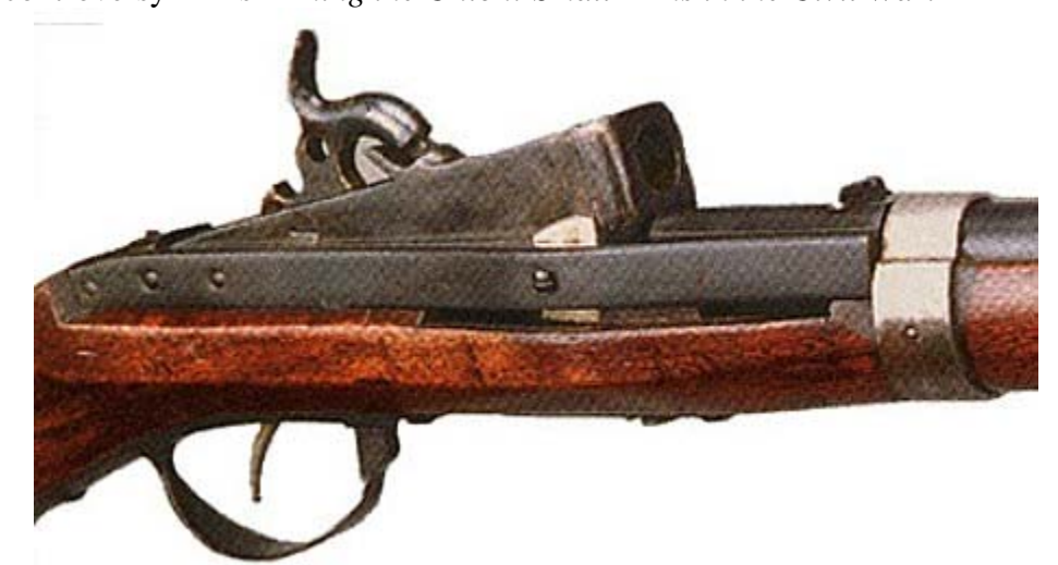
Hall Breech loader - Harpers Ferry Armory

Source: http://sportingoutdoors.blogspot.com/2008/04/hall-breech-loading-rifle-americas.html accessed December 7, 2011. Carl L. Davis, Arming the Union: Small Arms in the Civil War [Port Washington, NY: Kennikat Press, 1973], 107-112.