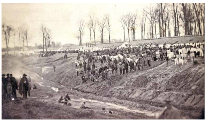
Figure 86. Camp Morton prison camp at Indianapolis, winter 1864. The ditch (foreground) was an unnamed creek the prisoners called the

The photographs, maps and diagrams are outstanding. It's easy to put a personal spin on a written statement but a period photograph provides a powerful and objective piece of evidence. The photograph below shows the prisoner of war camp at Camp Morton in Indianapolis during the winter of 1864. A Union Army surgeon wrote a scathing report of the conditions at Camp Morton in October 1863 and a new superintendent was appointed but in spite of adequate supplies of food, good water and wooden barracks, disease was rampant and approximately 1,763 prisoners died at Camp Morton.