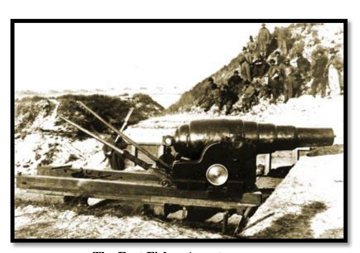
The Fort Fisher Armstrong gun

Jim McKee will share with our membership the story of the heavy guns that were placed in the numerous fortifications that the Confederates occupied to protect the Cape Fear region. Jim will provide details about the many types of guns and where they were acquired.