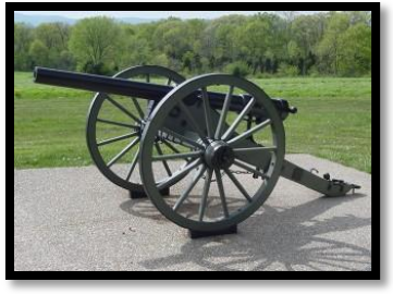
12 pdr. Whitworth Breechloading Rifle