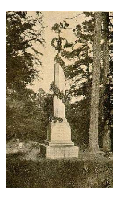
"Nor shall your glory be forgot, While Fame her record keeps, Or honor points the hallowed spot Where valor proudly sleeps."

1 – Where is the oldest North Carolina Confederate memorial located? Dedicated on December 30, 1868, the Cumberland County Confederate Monument is located in Fayetteville's Cross Creek Cemetery.