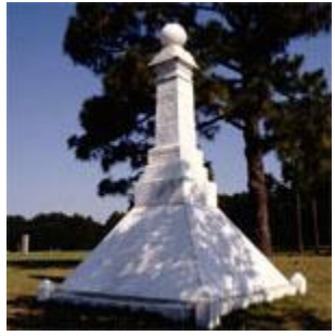
Goldsboro Rifles Monument

March 19<sup>th</sup> - Battle of Bentonville-Confederates strike Slocum's wing. Last Grand Charge of the Army of Tennessee.