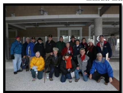
Bald Head Island tour participants