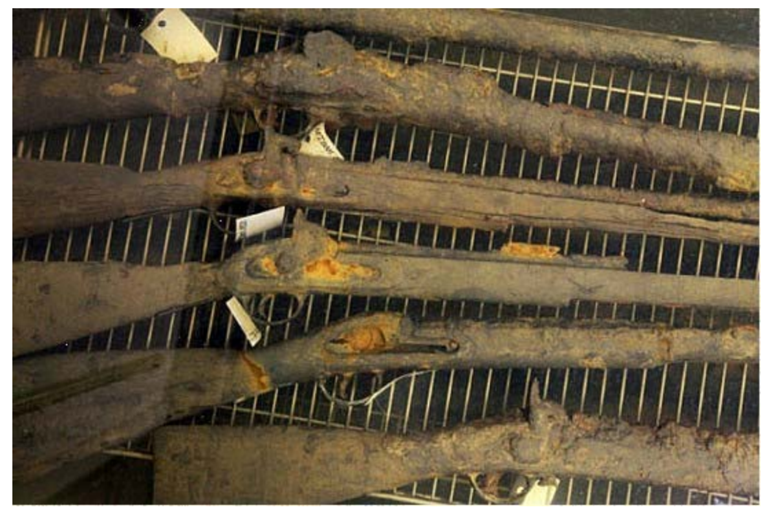
Through the Blockade

On March 5 - 7, eleven East Carolina University Maritime Studies graduate students and four interns from UNC Wilmington began efforts to discover what artifacts remained in those muddy outdoor storage tanks. This year marked the 150<sup>th</sup> anniversary of the sinking of the Modern Greece and the 50<sup>th</sup> anniversary of the original recovery effort. These student's efforts to clean out the tanks, catalogue the artifacts, and store them in more stable indoor wet storage was the beginning of a long conservation process that will allow these "bits of history" to be shared with the public.