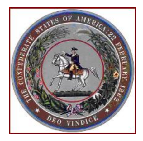
Great Seal of the CSA